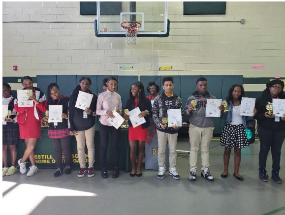
Celebrating our 9 th Grade Award Recipients